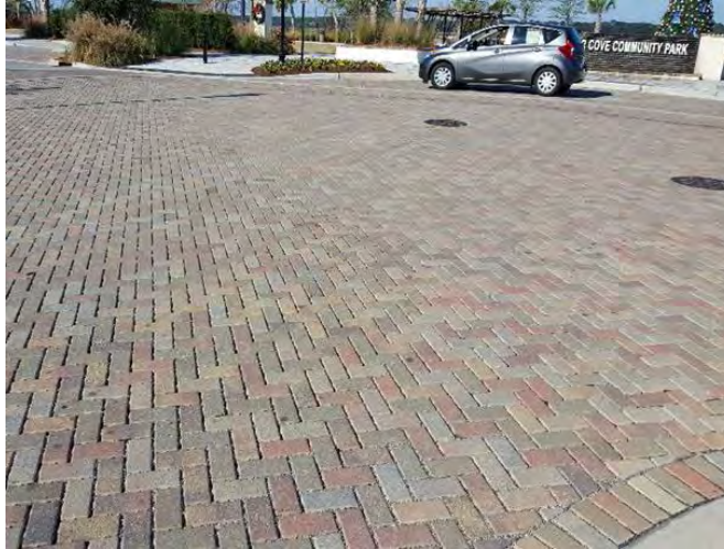
Figure 1. PICP used for parking and driveway.