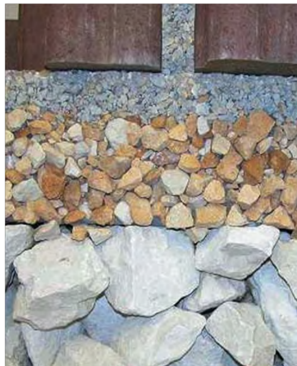
Figure 2. PICP photographic cross-section.

The reader should note that the author repeatedly references the “Guide Spec” throughout the course, specifically referring to the U.S. PICP Guide Specification that is publicly available on the Interlocking Concrete Pavement Institute (ICPI) website. For simplicity, the author uses US units of measurement given that the target audience is licensed engineers in the USA. Finally, although PICP is perfectly suitable for pedestrian surfaces, this course shall focus more on vehicular loads.