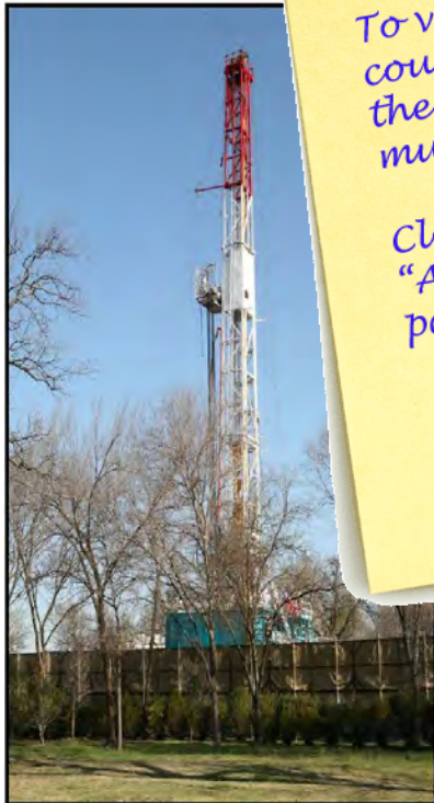
Source: ALL Consulting, 2008 Active Drilling Rig In The Barnett Shale Play

vertical or horizontal well. On a per well basis, production is often