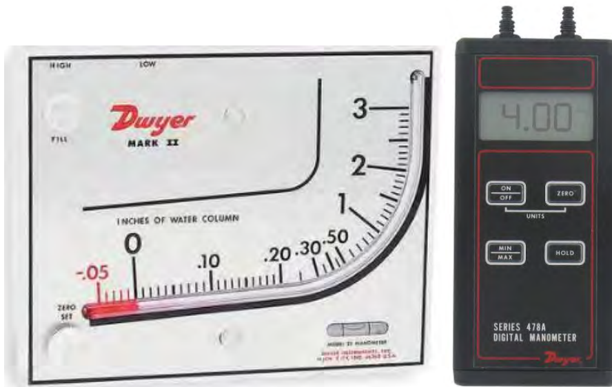
Images 1a and 1b – Examples of General Purpose Inclined Gauge and Digital Manometers

The upper range of manometer measurement is limited by atmospheric (or barometric) pressure, which serves as the pressure reference. Maximum measurable pressure utilizing a manometer is limited to approximately 10 psi (pounds per square inch). This pressure measurement limitation later leads to the development of the Bourdon Gauge.