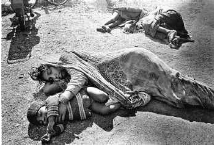
Figure 2: Casualties of the Bhopal Disaster

MIC is a chemical used to produce carbamate insecticides and herbicides and is extremely toxic to humans.