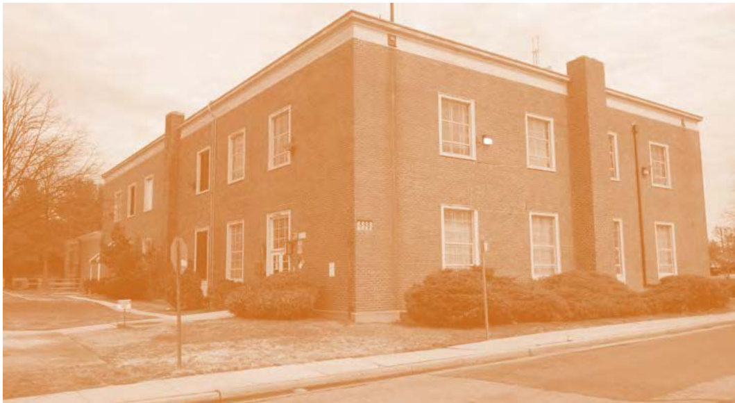
A Telecom Central Office