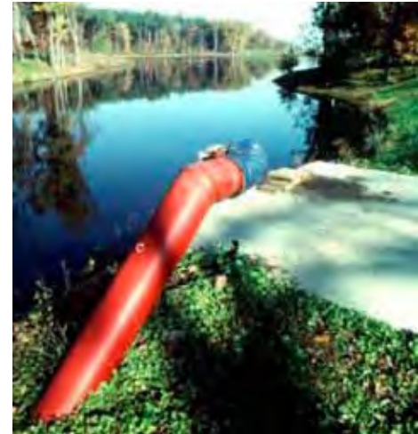
Figure 5 A dry hydrant is needed when a pond is close enough to a home or barn to furnish water for fire fighting

Many land users realize additional income by providing water for public recreation. If the