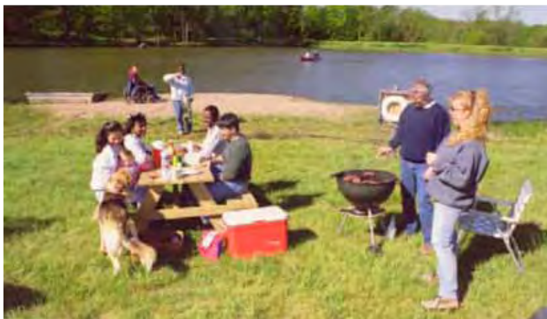
Figure 7 Ponds are often used for private as well as public recreation