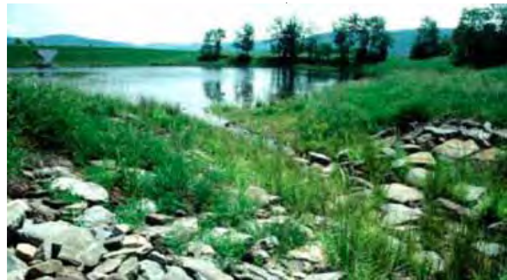
Figure 8 (left) Waterfowl use ponds as breeding, feeding, watering places, and as resting places during migration