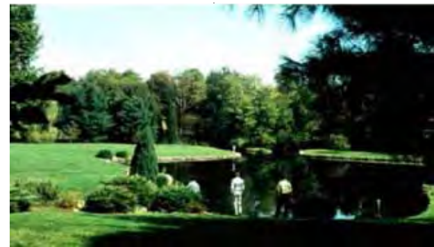
Figure 4 A pond stocked with fish can provide recreation as well as profit

A dependable water supply is needed for fighting fire. If your pond is located close to your house, barn, or other buildings, provide a centrifugal pump with a power unit and a