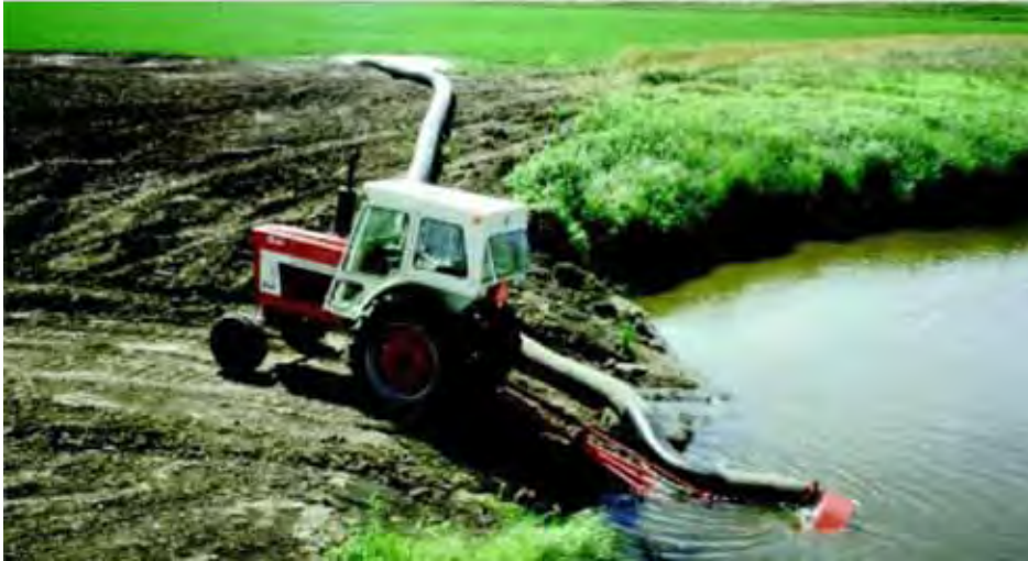
Figure 3 Water is pumped out of this pond for irrigation

water losses. For example, a 3-inch application of water on 1 acre requires 81,462 gallons. Consequently, irrigation from farm ponds generally is limited to high-value crops on small acreages, usually less than 50 acres.