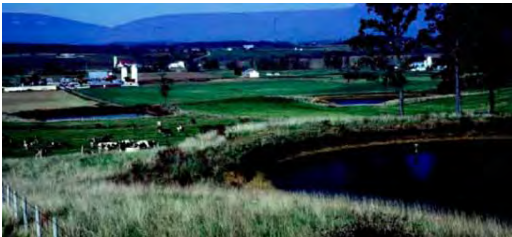
Figure 2 This pond supplies water to a stockwater trough used by cattle in nearby grazing area

Water requirements for irrigation are greater than those for any other purpose discussed in this course. The area irrigated from a farm pond is limited by the amount of water available throughout the growing season. Pond capacity must be adequate to meet crop requirements and to overcome unavoidable