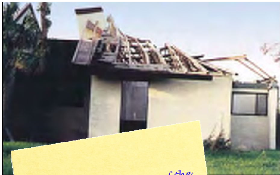
Figure 3 Hurricane Andrew (1992), Dade County, Florida. Roof structure failure due to inadequate bracing.

The progressive nature of failures is illustrated in Figure 3, in which the collapsed trusses are an indication that, once the sheathing was removed, the trusses lost the lateral support required for stability and for resistance to lateral wind forces.