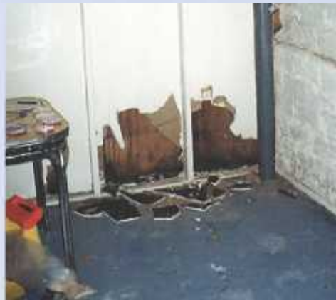
2B: Front side of wallboard looks fine, but the back is covered with mold