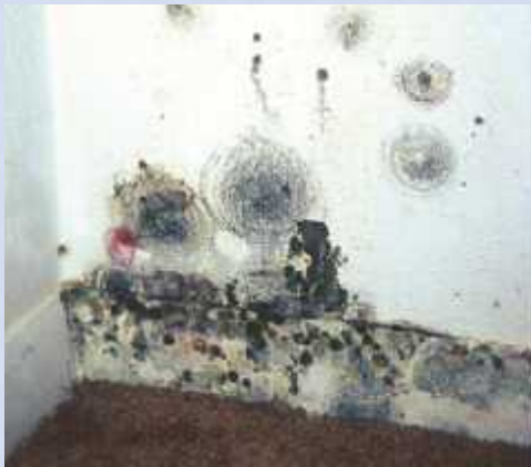
Photo 2A: Mold growing in closet as a result of Condensation from room air